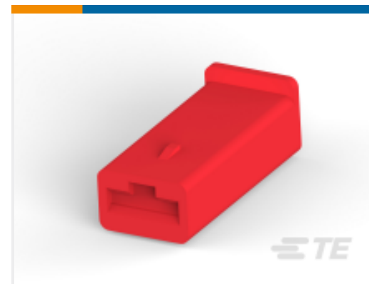
TE Part # 180905-1 FF 250 REC HSG 1P NYLON RED